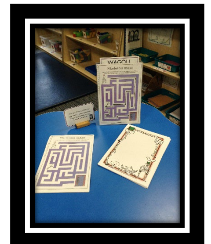
Can you help Big skeleton through the maze? Carefully stay within the lines!