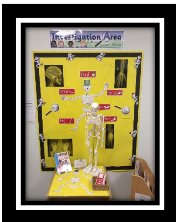
Can you build the Funny bones skeleton? Can you name the bones?