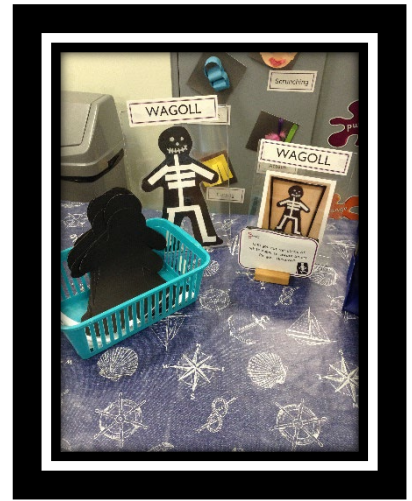
Can you cut out some bones and create a skeleton picture?