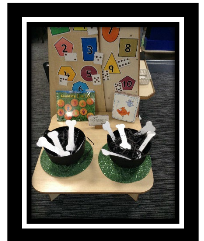
How many bones can you count? What numbers can you see on the bones?