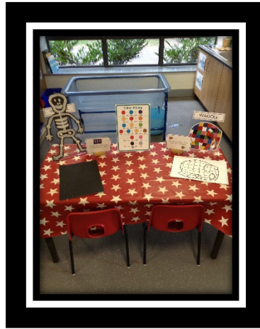
Can you paint a picture of a skeleton? Use Elmer to help you mix colours!