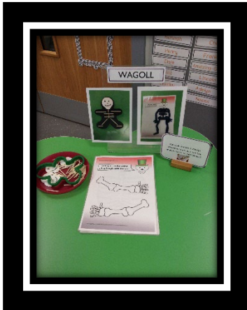
Can you use the dough to create a skeleton? Roll our bones or use the match sticks as bones?