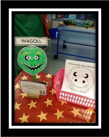
Can you paint your chosen dinosaur mask? What colours will you need?