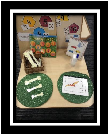
Can you sort the different sized dinosaur bones? Can you count the Pterodactyls?