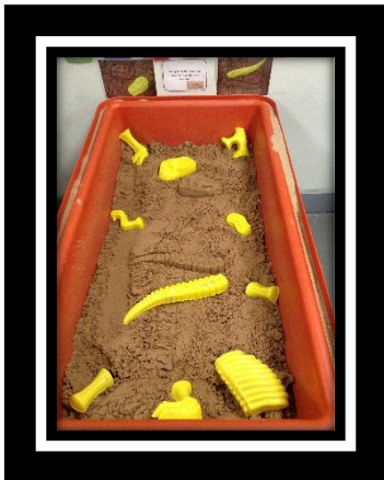
Can you create a dinosaur skeleton using the sand moulds?