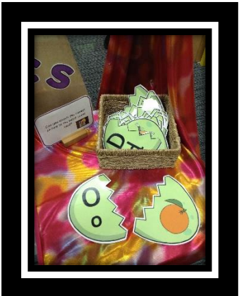
Can you match the correct picture to the initial sound on the Dinosaur egg?