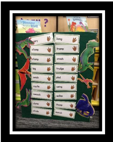
Can you create your own Dinosaur Dance? What moves will you use?