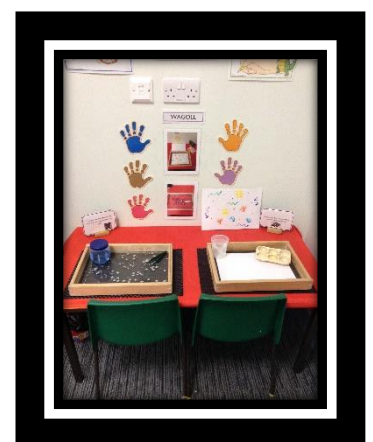
Can you create a firework picture using cotton buds and paint? Can you pick out the sequins from the gel tray using the tweezers?