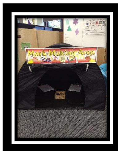
Can you practice your mark making and pencil grip in the dark den? Don't forget 'crocodile fingers'.