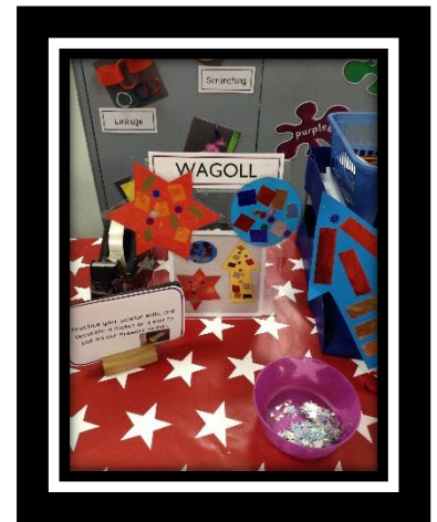
Can you practice your scissor skills to decorate a rocket, star or a circle.