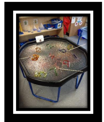
Can you practice writing your numbers in the glitter tray?