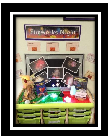
Tell a friend or a grown up what you know about Bonfire Night.