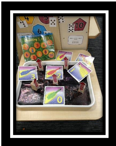
Can you order the numbered rockets? What number comes next?