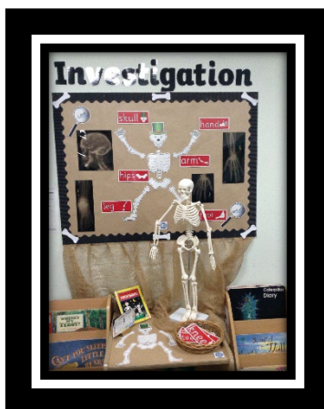
Can you build the Funny bones skeleton? Can you name the bones?