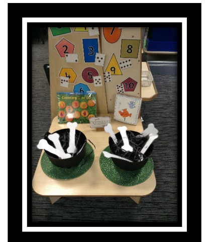
How many bones can you count? What numbers can you see on the bones?