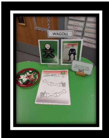
Can you use the dough to create a skeleton? Roll our bones or use the match sticks as bones?