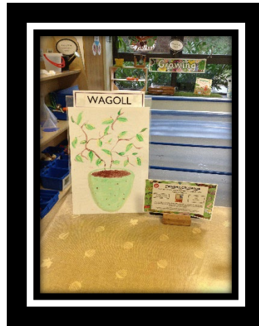
Can you paint an observational picture of Mrs Parkin's plant?