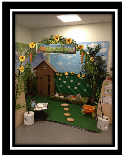
What can you discover in our Nursery garden?