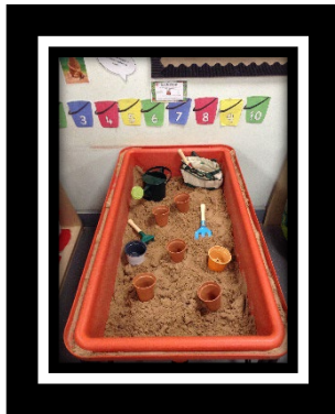
Can you pretend to plant some seeds? What will you need? Can you write a label for your plant pot?