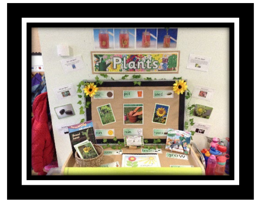
What do plants need to grow?