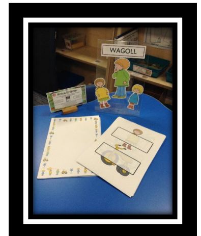
Can you draw the characters from the story?