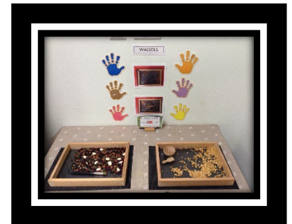
Can you pick up the corn kernels with the scoop? Can you mark make in the seed tray?