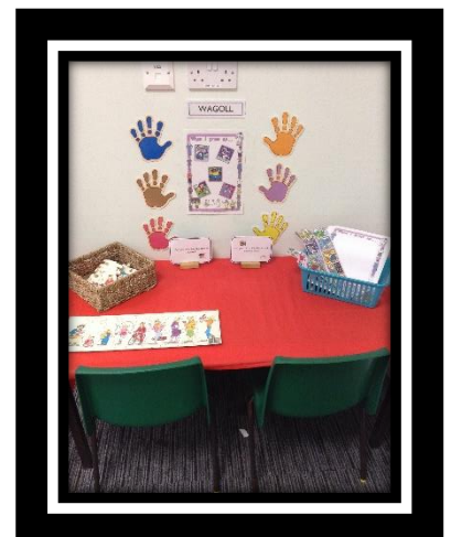
Cut out the jobs to stick onto your 'When I grow up' sheet. Can you complete the growing jigsaw?