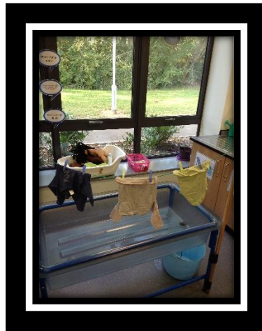
Can you give the babies a bath and wash their clothes?