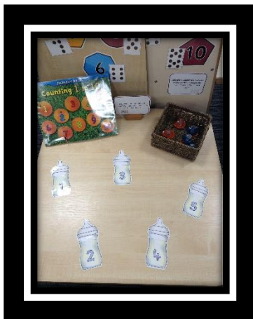
Can you count the dummies? How many do you see?