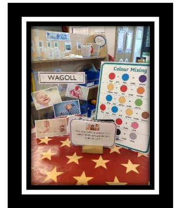
Can you paint a picture of yourself as a baby?