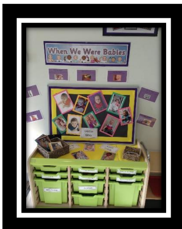
Guess Who! Can you look at the baby photos and say who they are?