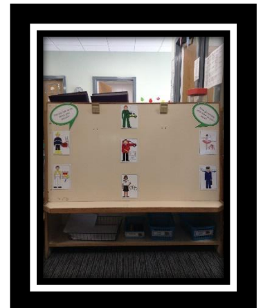
Draw a picture of what you would like to do when you grow up.