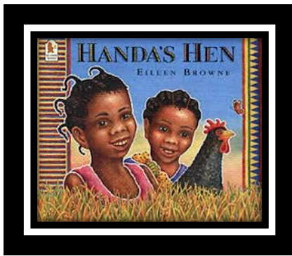
Book of the Week: Handa's Hen