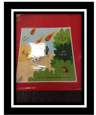
Can you substitute the objects on the sheet?