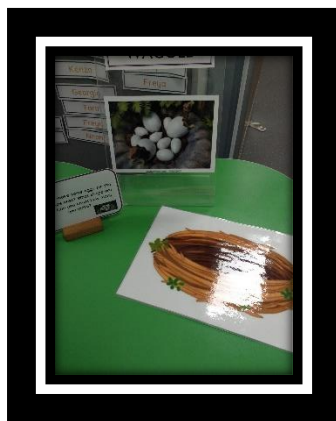
Can you make some dinosaur eggs for your nest? What shape are they? How many did you make?