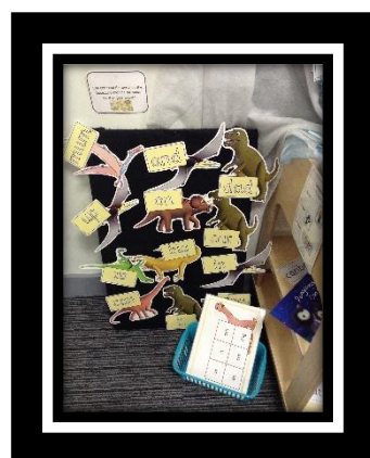
Can you read the words on the dinosaurs and find them on your board?