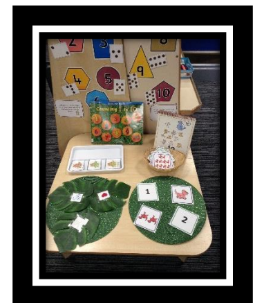
Can you count the correct number of dinosaurs? Can you sort the patterned Dinosaurs?