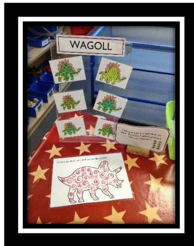
Can you paint a pattern onto your dinosaur?