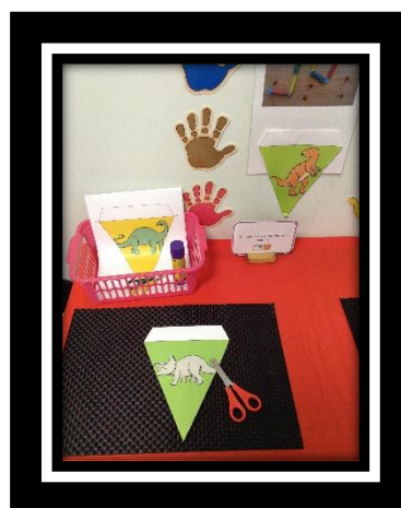
Can you cut out the Dinosaur bunting to decorate the nursery.