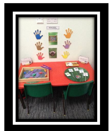
Can you thread the correct number of beads onto the Dinosaurs? Can you rescue the dinosaurs from the gloop with tweezers?