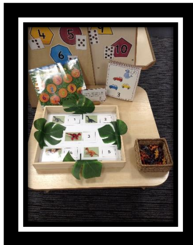
Can you count out the correct number of Dinosaurs?