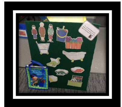
Use the resources to help you tell the story of Harry and his bucketful of dinosaurs.