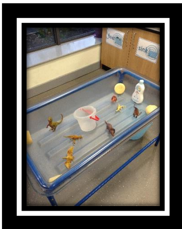
Can you wash the Dinosaurs like Harry did in the story?