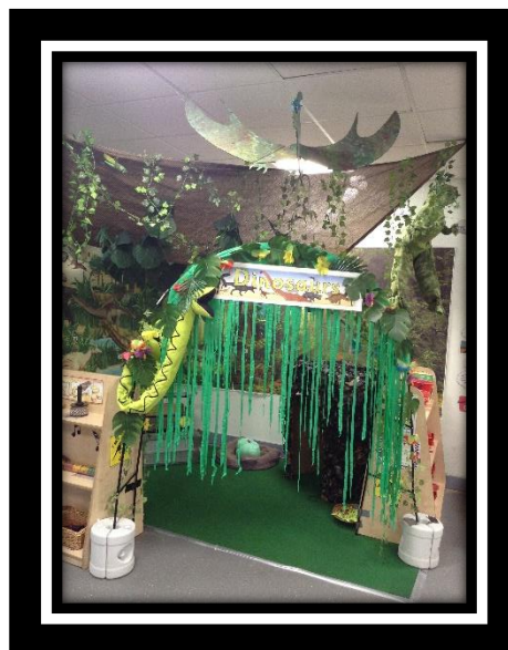
Can you explore our Role play? Who has left the eggs? What kind of dinosaur do you think it is?