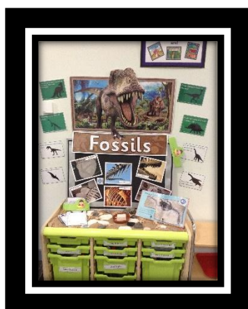
What can you find out about fossils?