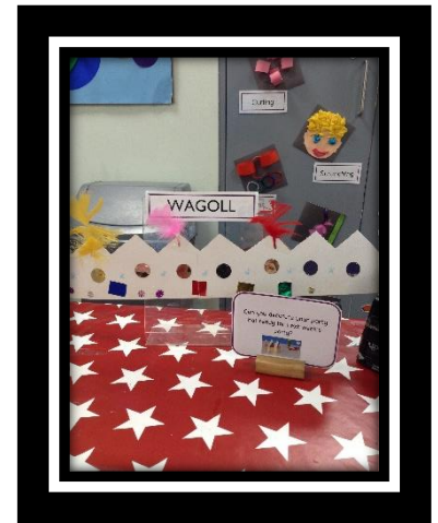
Can you decorate a hat for our party?