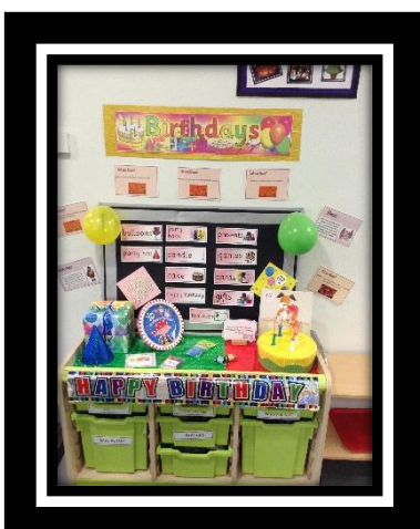
Tell a friend or a grown up what you know about Birthdays? What traditions do we have?