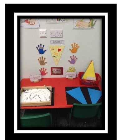
Can you make marks in the tray of flour? Don't forget 'crocodile' fingers!