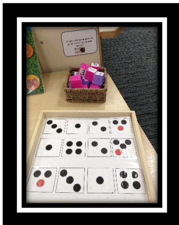
Can you subitise the spots on the board and place on the correct numbered present?