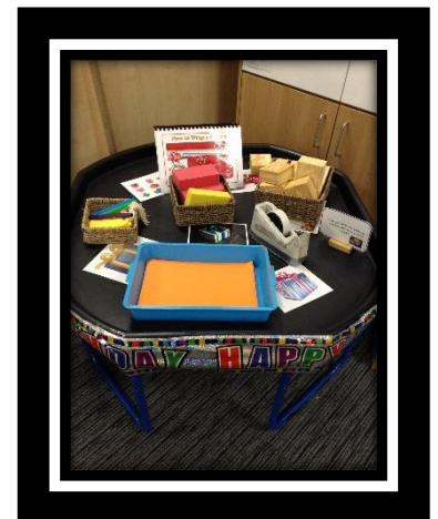
Can you wrap a present for a friend and write your name label to attach to it?