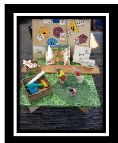
Can you find objects that are the same size as our 3 Billy Goats Gruff?