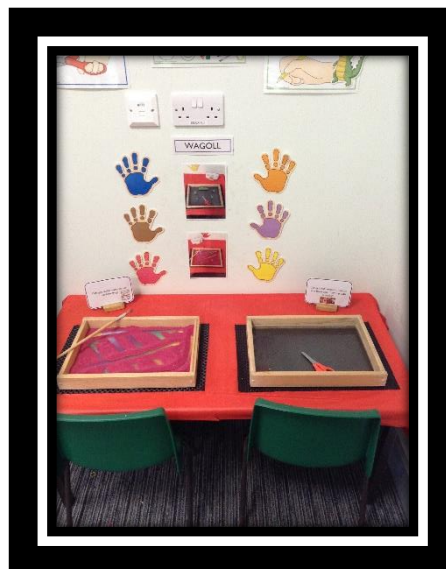
Can you roll lengths of dough and then cut it up using scissors? Can you make marks in our rainbow tray?