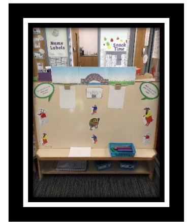
Can you add the characters to the story setting of The Three Billy Goats Gruff?