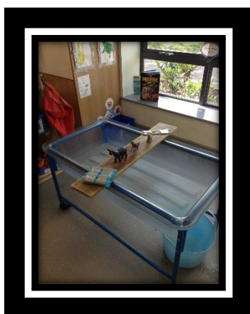
Can you make a floating raft to help the goats get across the stream?