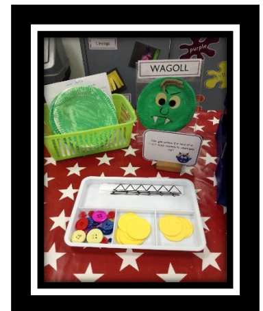
Can you use the resources to finish you Troll face?