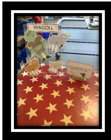
Can you paint a picture of the characters in the Three Billy Goats Gruff story?