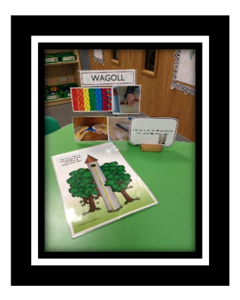
Can you roll the dough and weave it to create Rapunzel's plait?