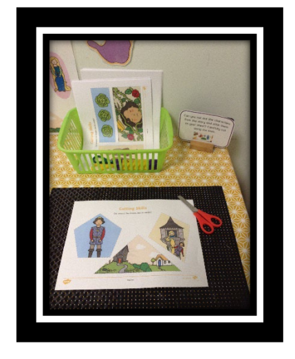
Can you cut out the Rapunzel characters and stick them on your sheet?