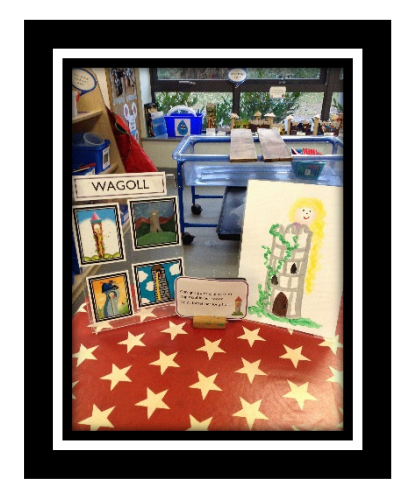
Can you paint a picture of Rapunzel in her tower? Don't forget her long hair!