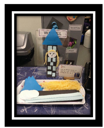
Can you cut out pieces of paper to create the brick work on Rapunzel's tower?