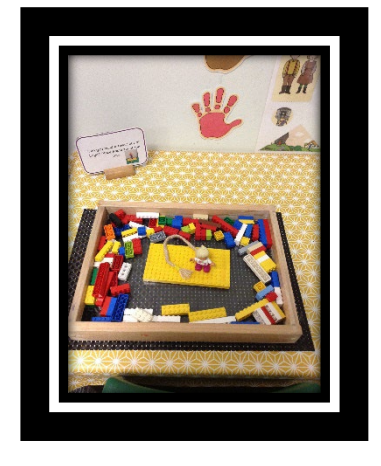
Can you build a Lego tower for Rapunzel?