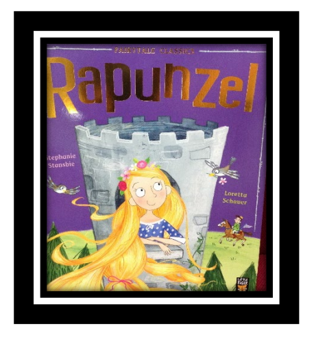
Book of the Week: Rapunzel