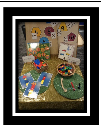
Can you create Rapunzel's tower out of shapes?