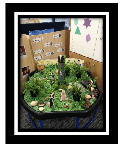
Can you retell the story of Rapunzel? Who are the characters? Where is the story set?