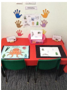
Can you cut out the sea creatures to stick into your ocean? Can you add the correct number of buttons (sucker pads) onto the Octopus's arms?