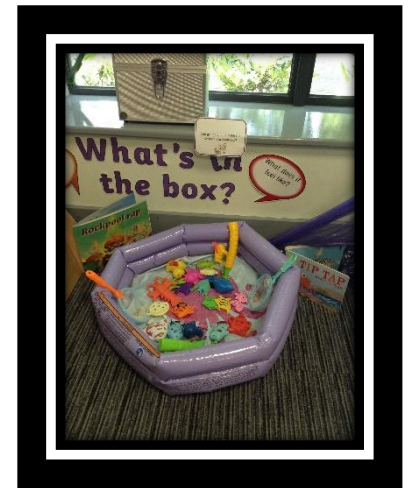
Can you catch and name the sea creatures?