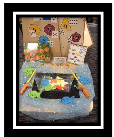
Can you name the shapes on the fish you catch? How many small fish can you catch?