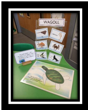
Can you create a dough sea creature? What skill will you need to create the various shapes?