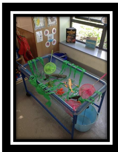
What creatures can you find in our underwater world?