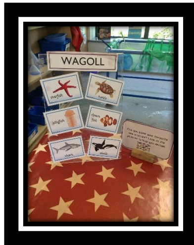
Can you paint your favourite sea creature?