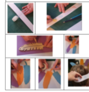
How to make your tribal headdress.