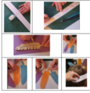
How to make your tribal headdress.