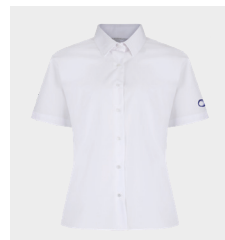
Twin Pack Shirt or Blouses