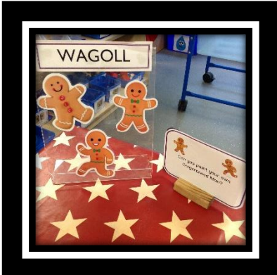
Can you paint the Gingerbread Man? What colours will you need?