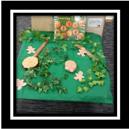
How many Gingerbread Men can you find? Do you recognise the numbers?