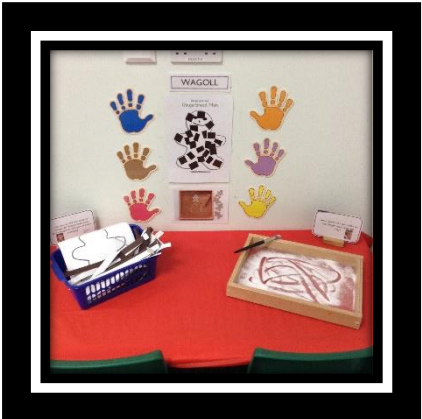
Practice your scissor skills by collaging the Gingerbread man. What marks can you make in the Ginger spice tray?