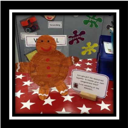
Look carefully at the shapes. Can you make them into a Gingerbread Man? How will you join them together?