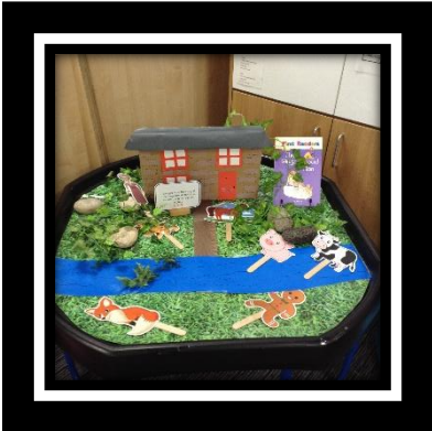
Can you retell the story using the puppets in our Tuff tray?