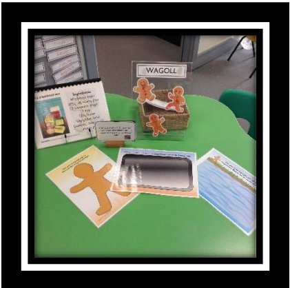
What ingredients do you need to make a Gingerbread Man? Can you roll out a dough GB Man?