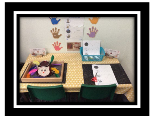
Can you practice your scissor skills by cutting along the line? Can you carefully place the feathers in the colanders holes?