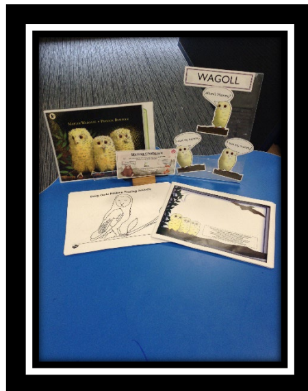
Can you draw the Owl babies? Maybe you could have a go at writing a speech bubble for them.