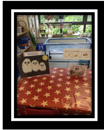
Can you use the cotton wool to paint the owl babies? What other features do you need to paint?