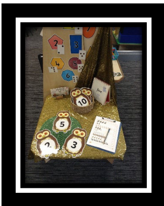
Can you order the owl numbers? Can you complete the owl counting sheet and record the numbers?