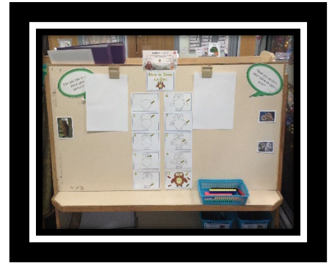
Can you use the cards to help you draw a picture of an owl? Look closely at each step.