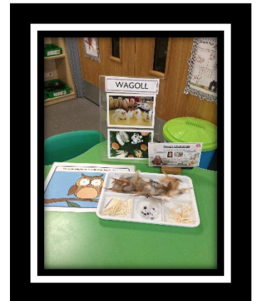
Can you make a dough owl? You could add real feathers or choose a tool to create a feathered effect.