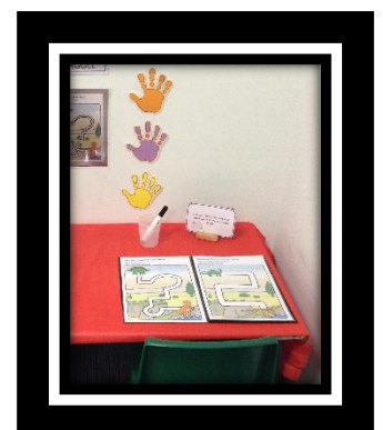
Can you help the dinosaurs get through the maze? Remember to stay inside the lines!