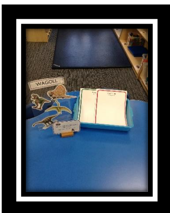
What dinosaur are you going to draw today? A Herbivore or a Carnivore?