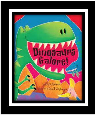
Book of the Week: Dinosaurs Galore