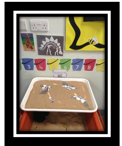
Can you find the different parts of the dinosaur skeleton and put them back together?