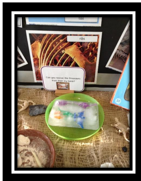
Watch the ice melt and the dinosaurs set free!