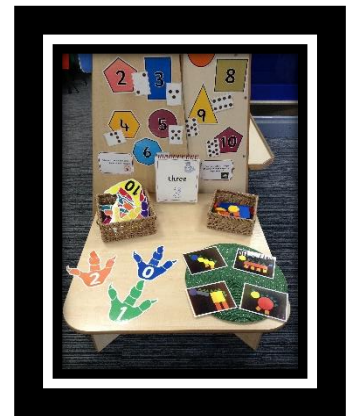
Can you order the numbered dinosaur feet across the carpet? What comes before / after?