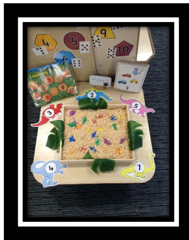
Can you rescue the dinosaurs? How many can you find? Put them into groups and count them.