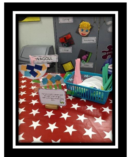
Can you create a paper plate Dinosaur? Practice your cutting, joining and scrunching skills.