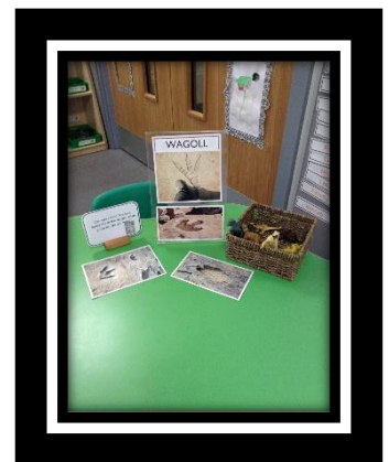
Can you create Dinosaur footprints in the dough? What patterns can you make?