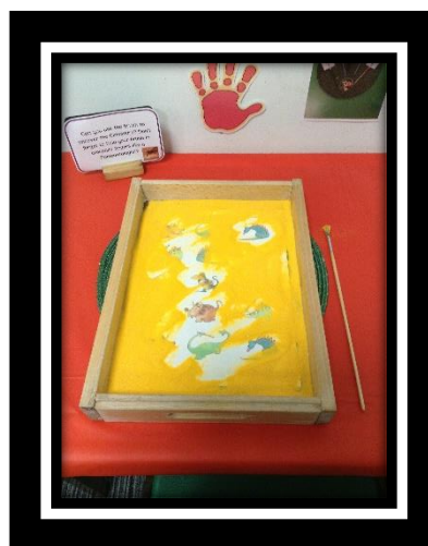
Can you use a brush to uncover the dinosaurs? Don't forget to hold your brush in 'crocodile' fingers!