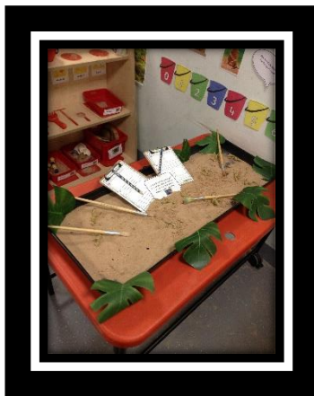
Can you be a Palaeontologist? Uncover the bones in the sand and draw a picture of what you find.