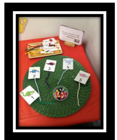
Can you thread the correct number of beads onto the Dinosaurs?