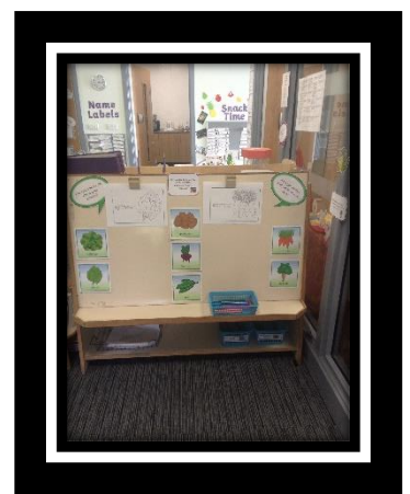
Can you colour in the pictures from the story?