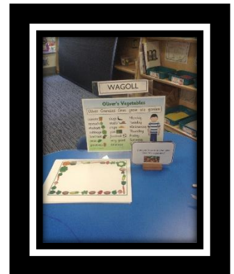
Can you draw and label your favourite vegetable?