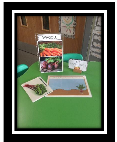
Can you make your own dough Vegetable? How are you going to make it? What techniques will you use?