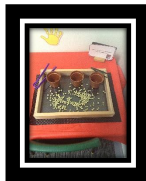
Can you make some marks using a carrot? Can you pick up the peas using tweezers?