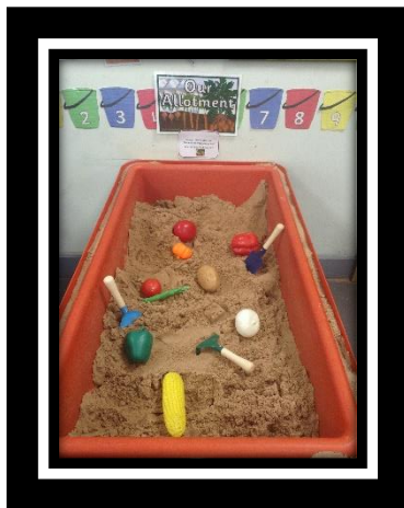
Can you create your own Vegetable allotment in the sand tray?