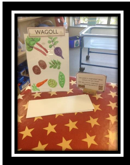
Can you paint a picture of some vegetables? Can you create a repeating printed pattern using a vegetable?