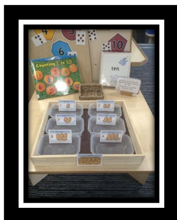
Can you count out the correct number of potatoes?